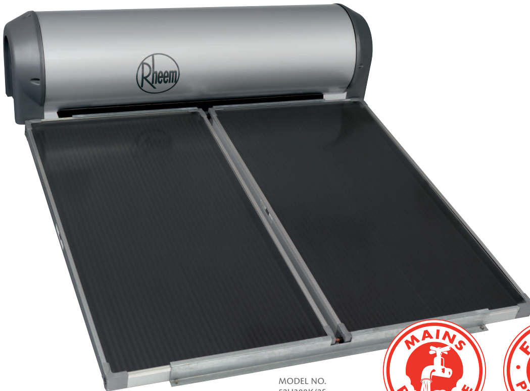
MODEL NO. 52H300K/25